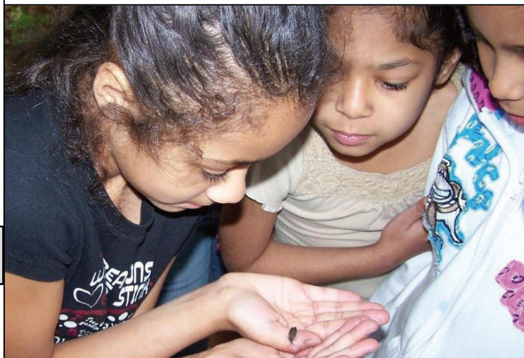
Youth from Girls, Inc. observe a beetle at the Alcott Cemetery, off Alcott Street, where the girls learned how cemeteries can provide unique habitats within an urban setting.

Anstiss & Co., P.C. Eno, Boulay, Martin & Donahue LDFC/Lowell Plan